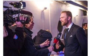
2016 Shelter Movers' Inaugural Gala "Into the Blue"